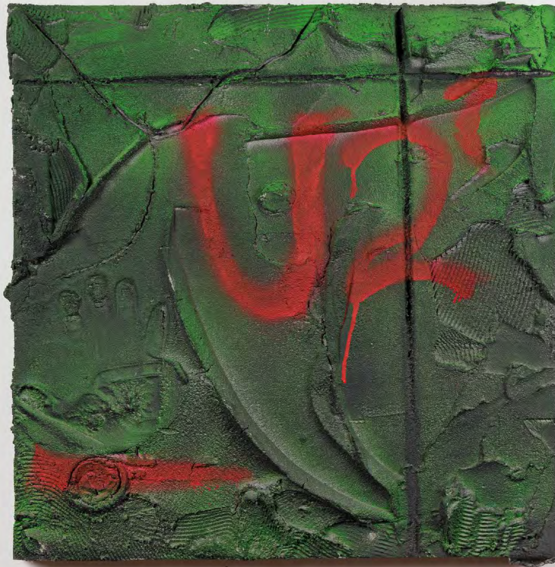
We Got This, 2024 Spray paint, concrete on wood panel 30"x 30"