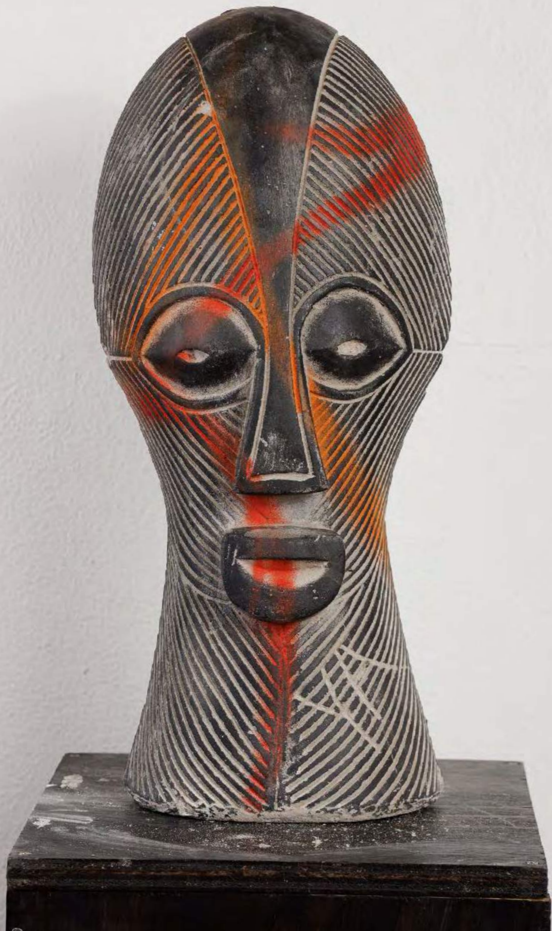
5996 and Glyphs, 2024 spray paint, concrete