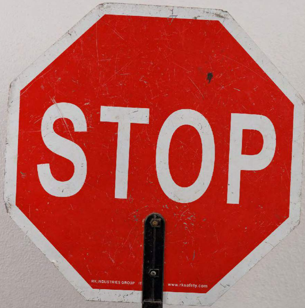
Ain't No Coincidences, 2024 stop sign, concrete, coffee mug Varying dimension