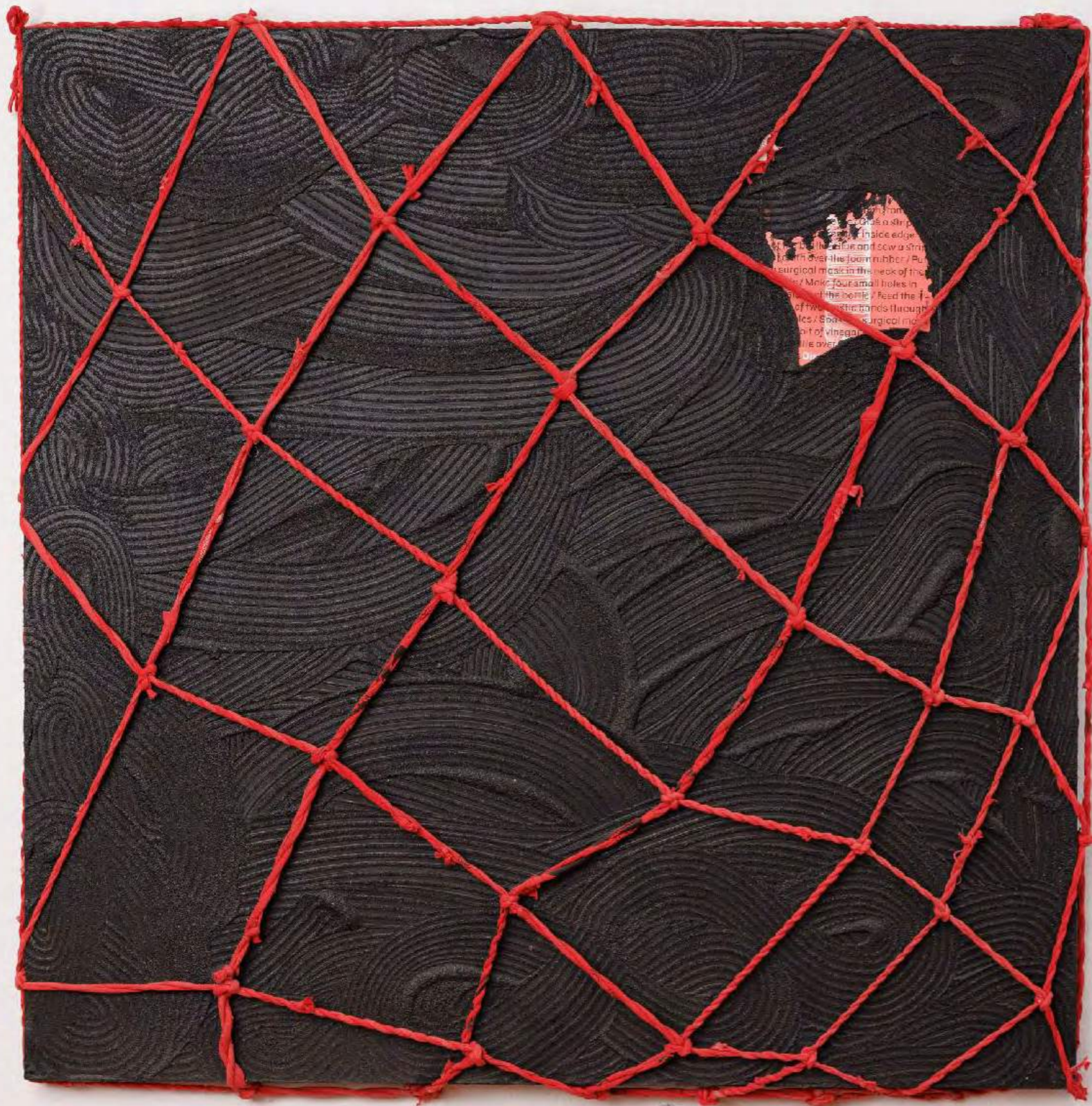
Immortal Technique, 2023 acrylic, pumice stone, repurposed cotton shirts, book cover on wood panel 48"x 48"