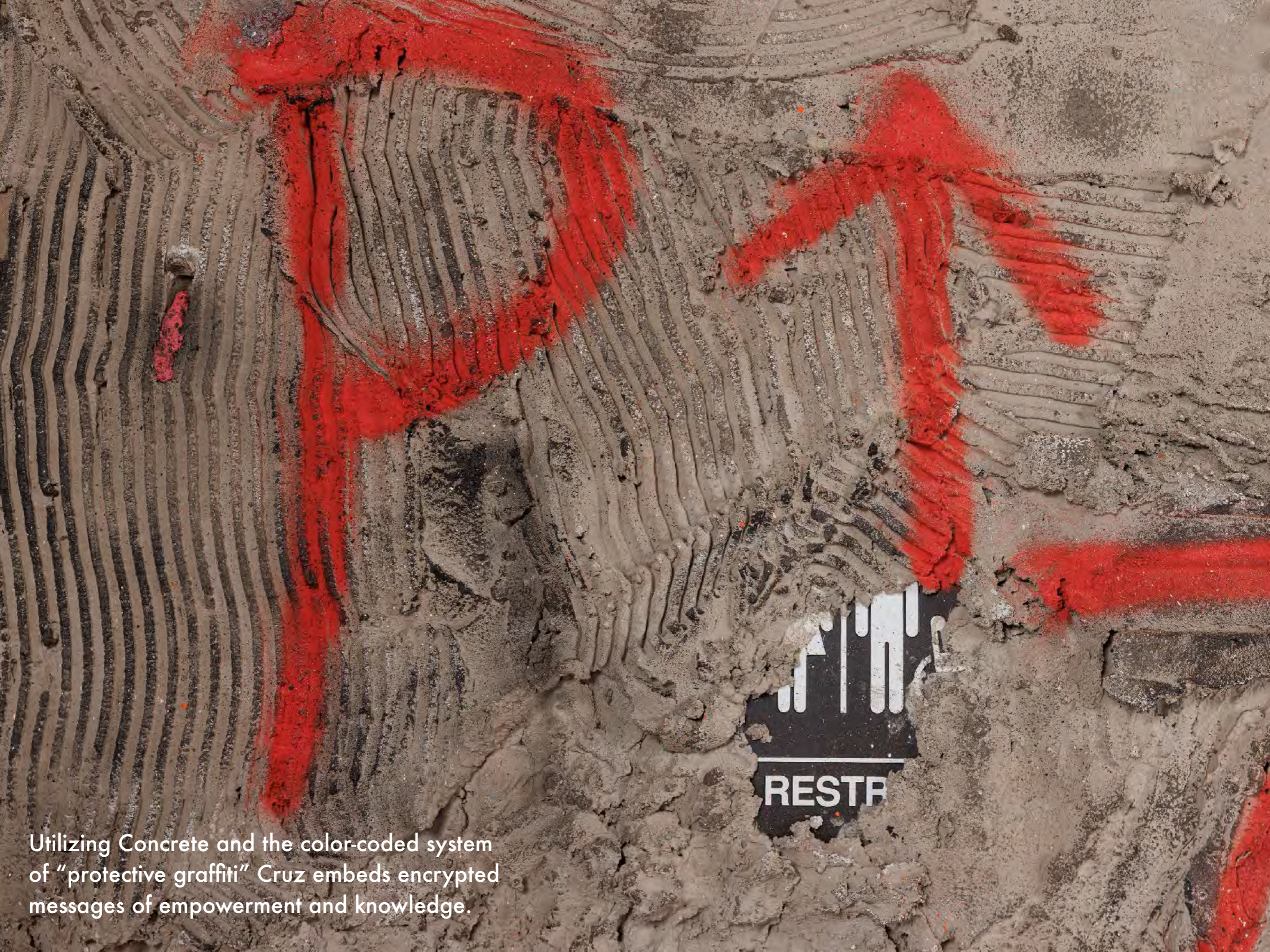
Utilizing Concrete and the color-coded system of "protective graffiti" Cruz embeds encrypted messages of empowerment and knowledge.