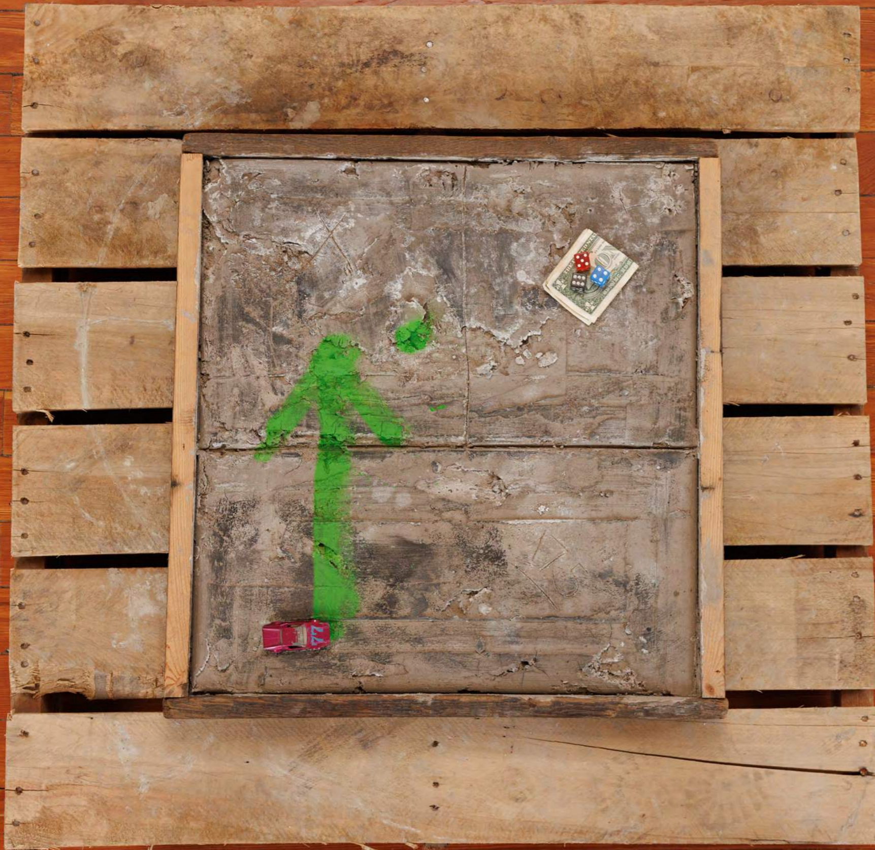
Commandments, 2024 USD, dice, toy car, concrete, spray paint, wood 24"x24"