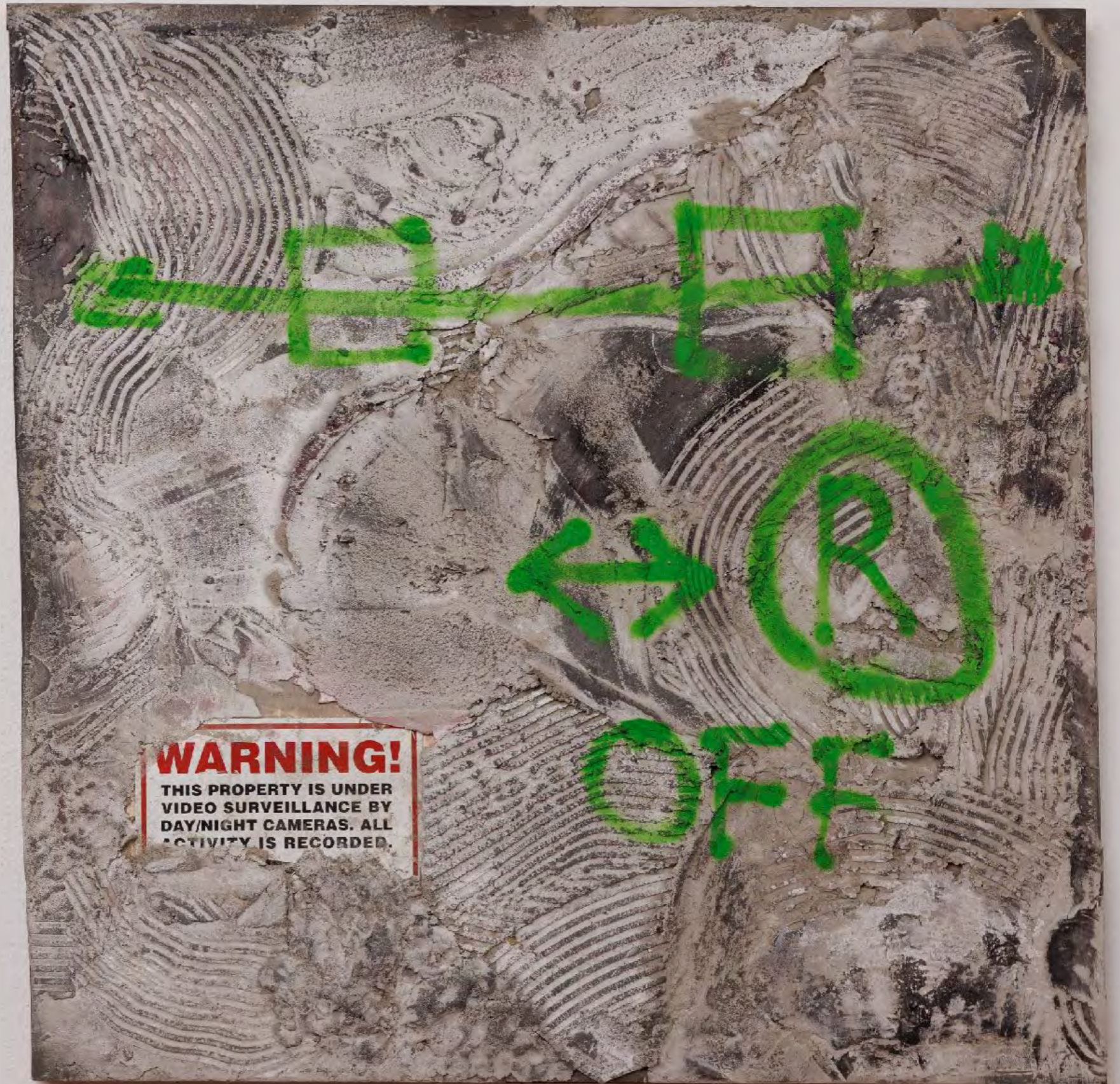
Now You See Me, 2024 spray paint, street sign, concrete on wood panel 35"x 35"